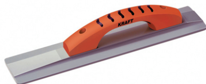
Manesium Float with ProForm Handle