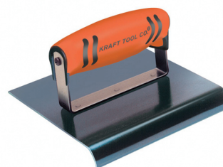
Flexible Blue Steel Edger with ProForm Handle