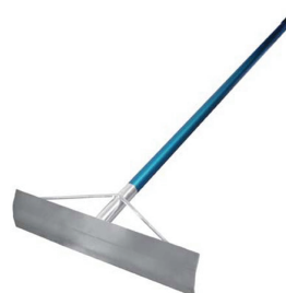
Right Angle Placer