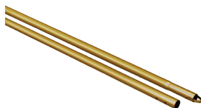
Aluminum Button Swaged Handle