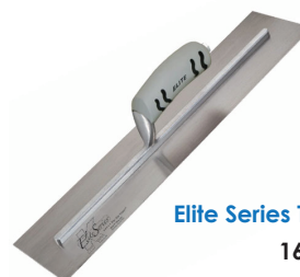
Elite Series Trowel