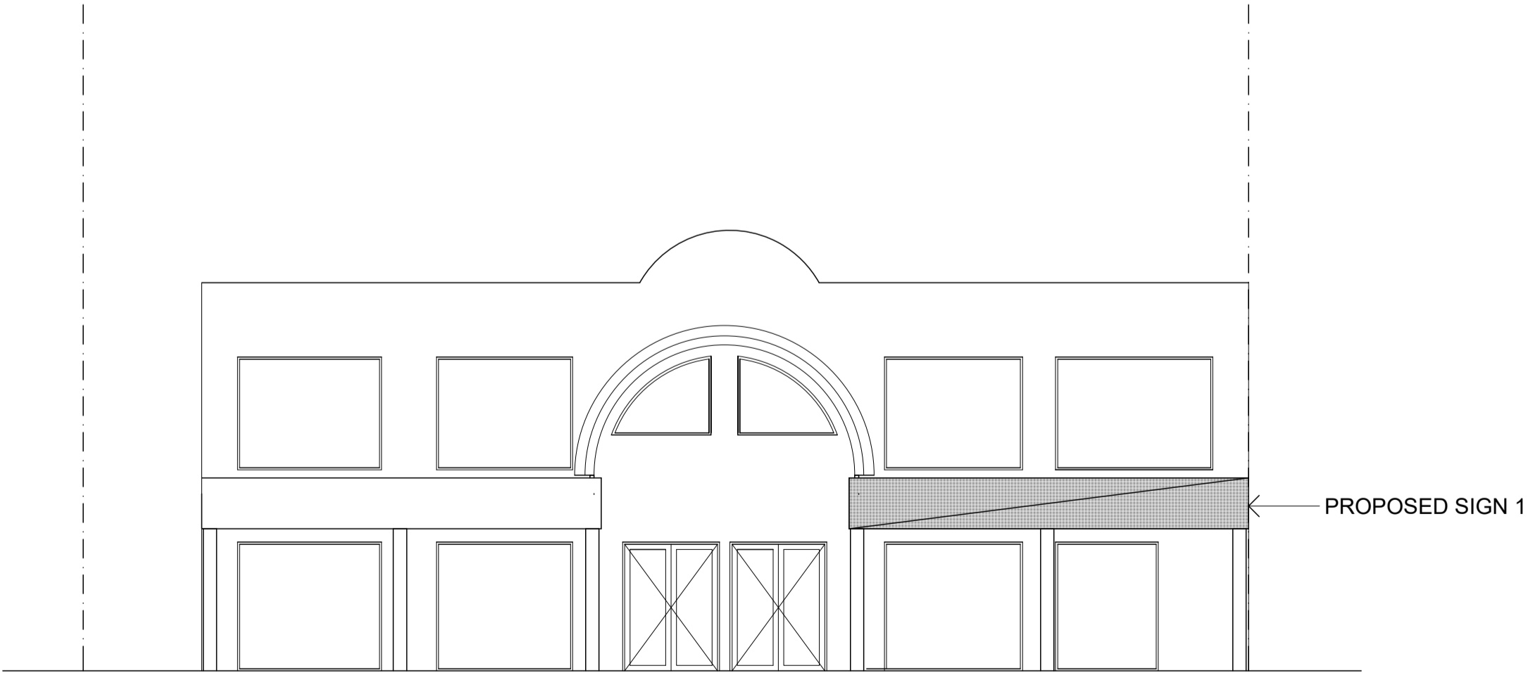
PROPOSED EXTERNAL WORKS - SOUTH FACADE 1:100 @ A3