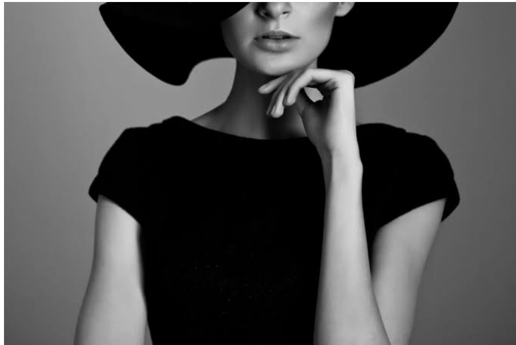
the left arm