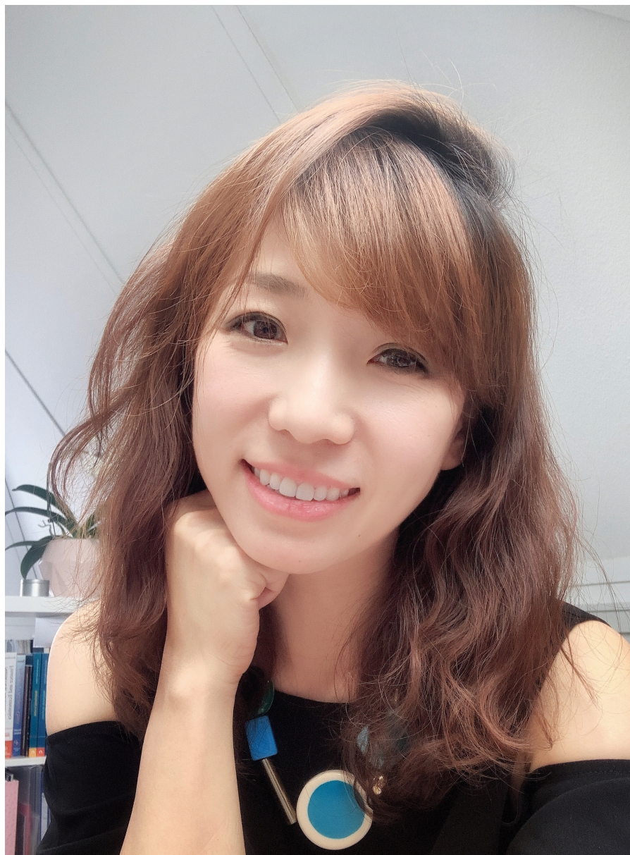
My selfie & collarbone