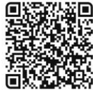
Santa Monica Portfolio $5,800,000