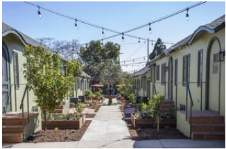
937 E. California Blvd. Pasadena $4,950,000

CRENSHAW GARDENS 3411-3427 Crenshaw Boulevard Los Angeles, CA 90016