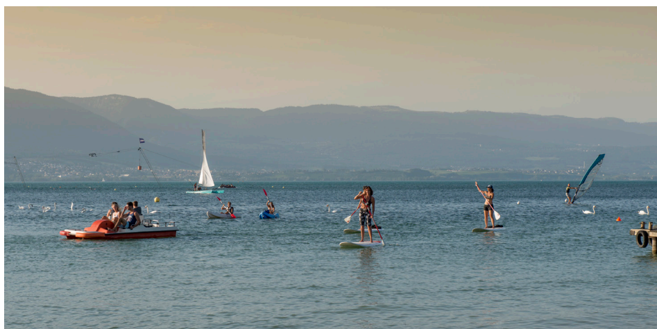
Estavayer-le-Lac is home to the best-equipped watersports center in Switzerland.

This document was produced in partnership with: