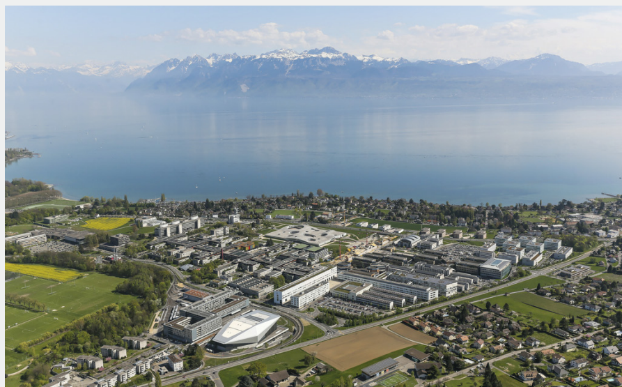
Aerial view of the EPFL campus

Top-qualified and multilingual, reliable and competent, Swiss employees are also the most highly motivated in the world. The region surrounding Aeropole Competence Center benefits from a large pool of workers and