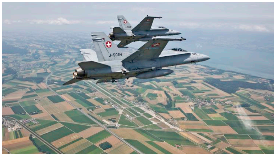
Aeropole Competence Center hosts the principal base for the Swiss Air Force.