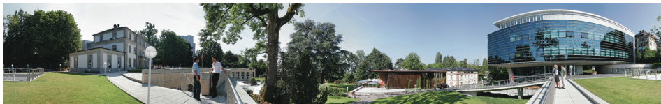
IMD Business School, Lausanne

IMD Business School – International Institute for Management Development 75 km Ranked #1 worldwide by Financial Times in open programs for four years in a row; its MBA program consistently places among Forbes' top list www.imd.org