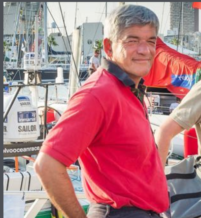
Dominique Dubois © Image Multiplast

attracts talent from around the world thanks to its excellent standard of living. The cantons of Fribourg and Vaud have a combined population of over 1 million inhabitants and growing.