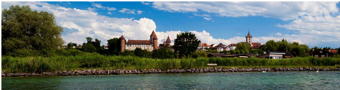
The medieval town of Estavayer-le-Lac © VincentP.