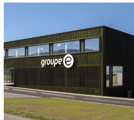
Groupe E is involved in clean technology.