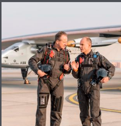
André Borschberg (left) and Bertrand Piccard (right)

"The support of the city of Payerne, of the region and of the aerodrome was key in turning this project into reality. We will bring with us all the good times spent here. Without Payerne, there would have been no Solar Impulse 2, no mission, no Round-the-World flight."