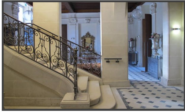
ENTRENCE HALL & STAIRCASE