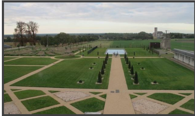
REAR FORMAL GARDEN