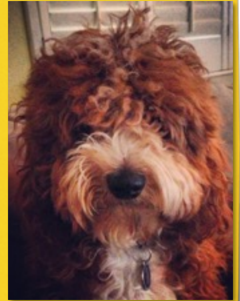
THE ONE AND ONLY RICKY BOBBY