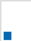
1/12 PAGE 2.25 x 2.25"