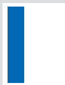
1/3 PAGE VT. 2.25 x 9.625"