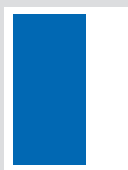
2/3 PAGE 4.75 x 9.625"