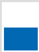
1/2 PAGE 7.25 x 4.75"