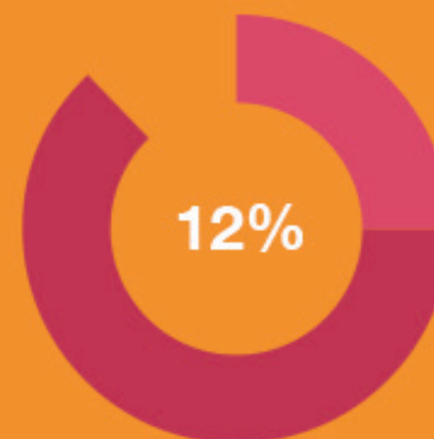
Category Name 3