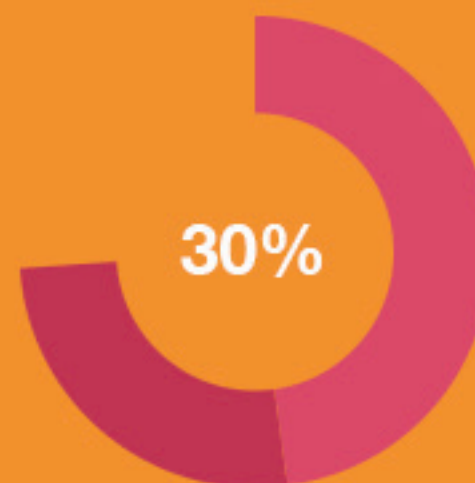
Category Name 2