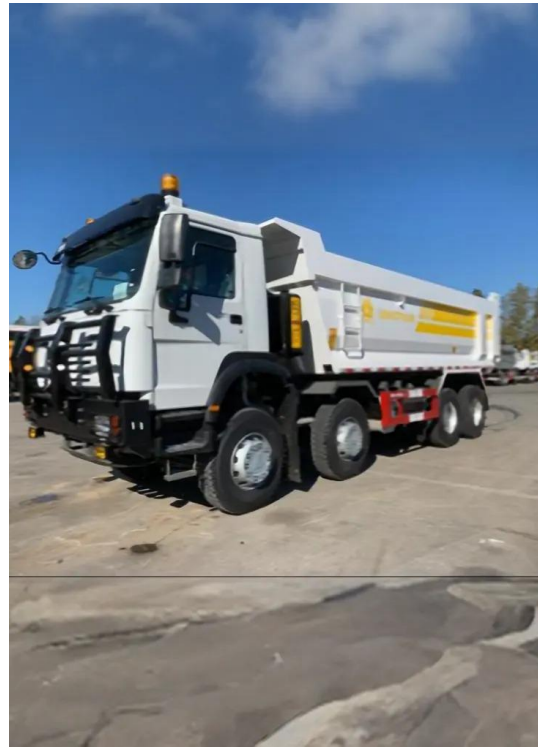
Light trucks and special vehicles