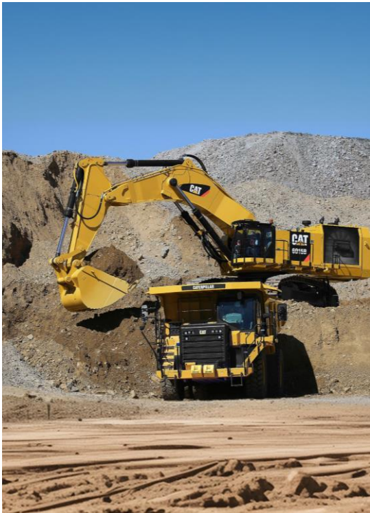
Heavy machinery (excavators, bulldozers, dump trucks)