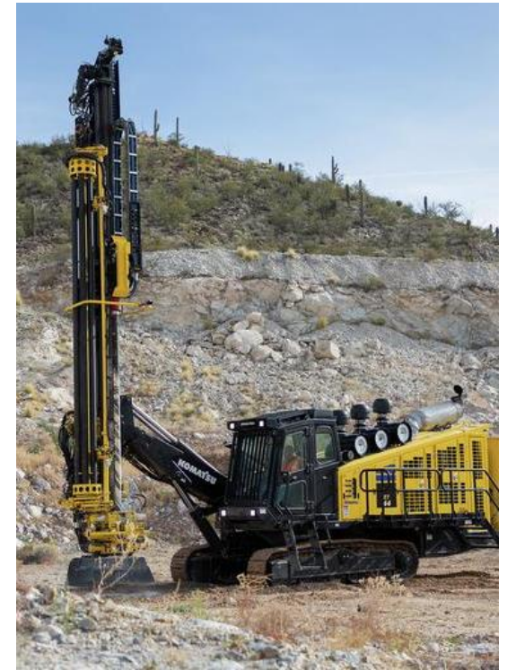
Drilling and crushing equipment