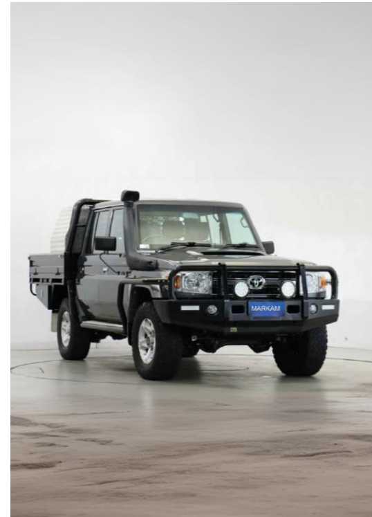
Light Vehicles and buses