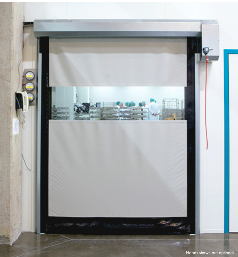
Hoods shown are optional.