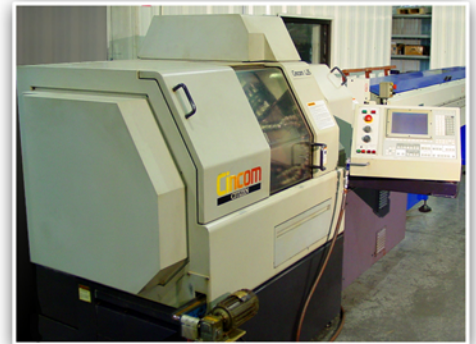
Cincom Citizen L25