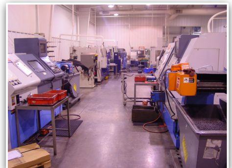
View of CNC Turning Area