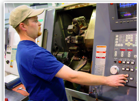
Live Tooling & Sub-Spindle Lathe