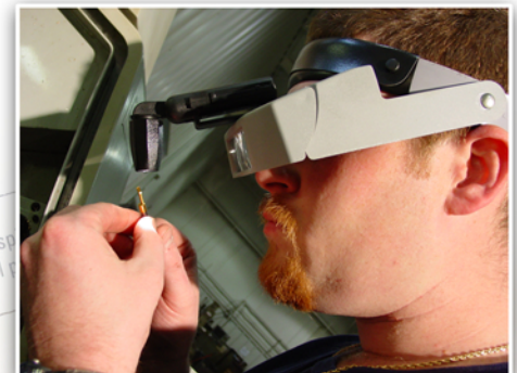
Attention to customer details