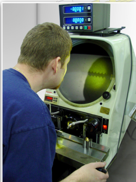
Inspection by Optical Comparator