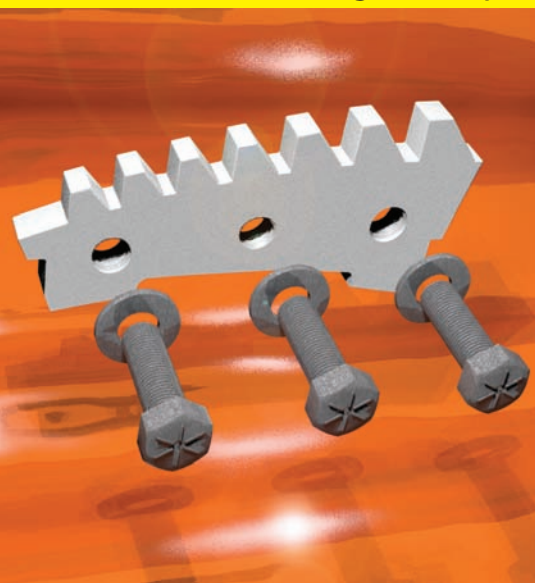
INSERT TYPE: A

Contact the Nicholson Service Department for proper selection of inserts for your application. Fiberguard is patented. Fiberguard is a registered Nicholson trademark.