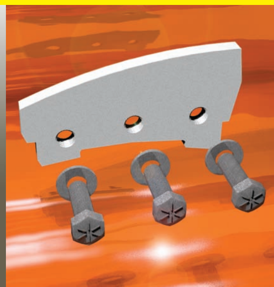
INSERT TYPE: SPIKELESS