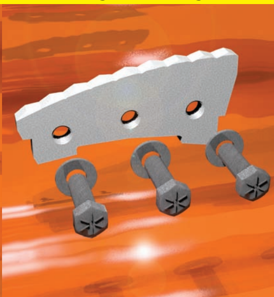
INSERT TYPE: D