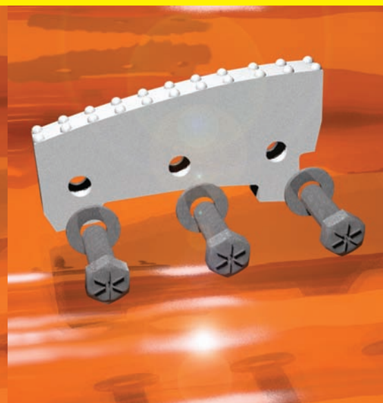
INSERT TYPE: DIMPLED