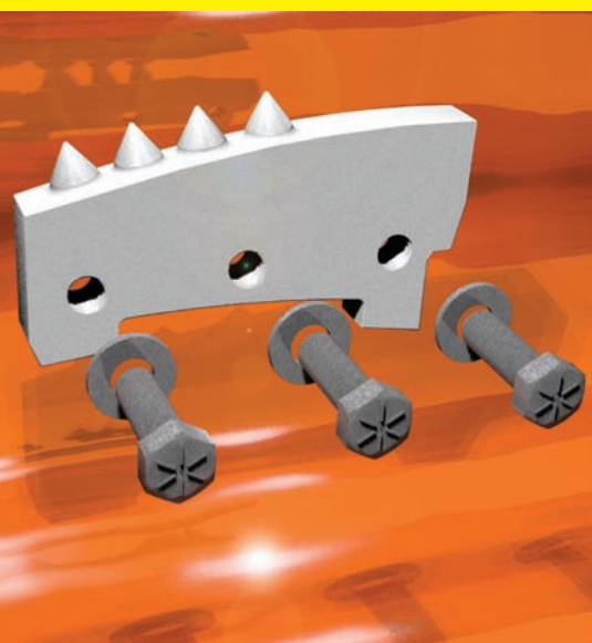
INSERT TYPE: SPIKE