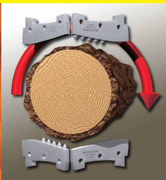
SPIKE AND SPIKELESS INSERT APPLICATION