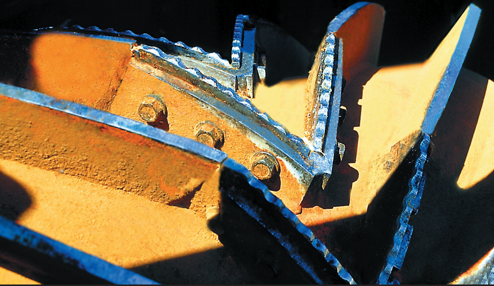
TYPE 'D' FIBERGUARD FEEDROLL INSERTS AFTER 7.5 MONTHS OF 2 AND 3 SHIFT HARDWOOD SAWMILL OPERATION: NICHOLSON 27 INCH DEBARKER.