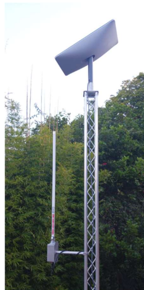
A secure regatta network