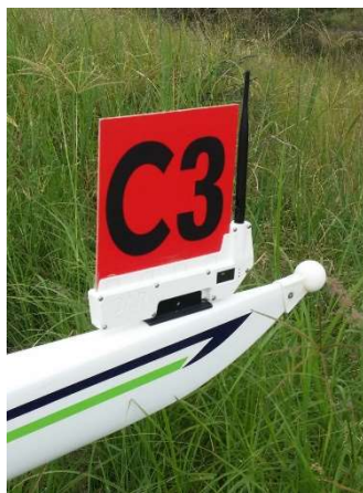
a propriety GPS tackler