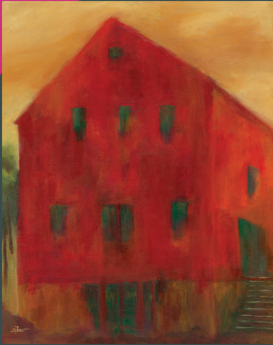
Beverly Shaw-Starkovich Boat Yard Relic