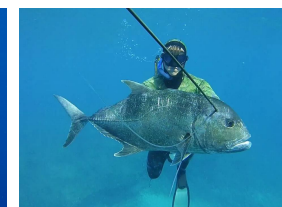
Late afternoon Strike