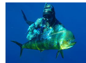
Mahi Mahi mission accomplished

We welcome all experience levels and you will be accompanied by a safe diver in the water at all times to help you with anything you need! You are welcome to take along your equipment, however we provide the best equipment in the market. Our fishing grounds are all offshore so our Spearfishing Charters are all full day (minimum 8 hours). Maximum of 6 guests (4 divers)