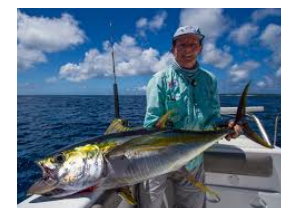
Yellow Fin Tuna, great catch

Our Fishing Charters are all Offshore Trips. Depending on your choice we can offer a variety of fishing options. For the experienced angler, test your skills by casting lures or if you're just a beginner bottom fishing baits is always a good way to go. We specialise in putting you on big fish and will do what it takes to make sure you get a chance to experience what drag screaming is all about. Maximum 6 guests (4 anglers).