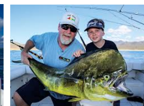
What about this? You better Belize!