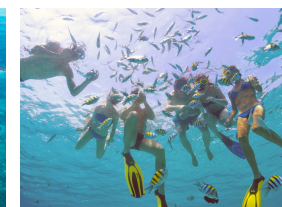
Not all classrooms have four walls.